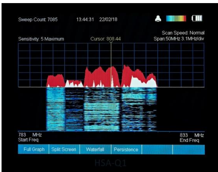
Split Screen (Half Waterfall) – Zoomed in to 50 MHz Span showing 4G Cellular Activity at 800 MHz