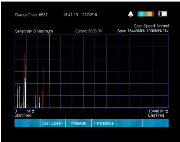
Main Screen showing full 13.44 GHz Span (1000 MHz per division)